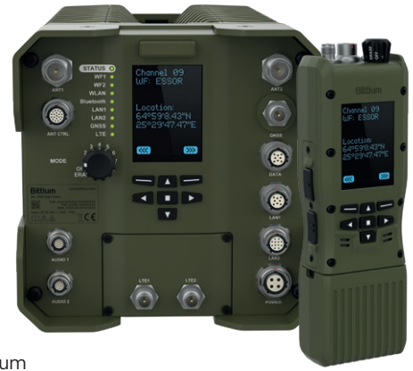
Bittium Tough SDR Handheld™ and Bittium Tough SDR Vehicular™

software-based functionality of the Bittium TAC WIN system, it can be easily updated with additional performance cost-efficiently during the whole lifespan of the system.