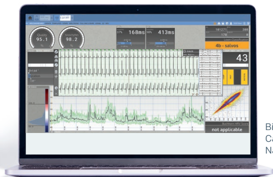
Bittium Cardiac Navigator™

which enables precise long-term full disclosure ECG measurements for long-term Holtering, cardiac event monitoring, mobile cardiac telemetry and assessing autonomic nervous system functions.