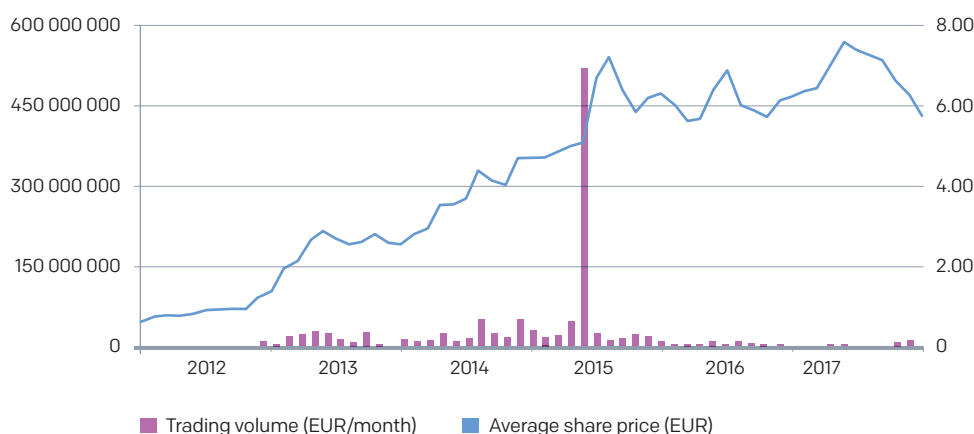
Trading Volume and Average Share Price 2012–2017

At the end of 2017, Bittium Corporation had 21,985 shareholders. The ten largest shareholders owned 28.4 percent of the shares. Private ownership was 74.6 percent. The percentage of foreign and nominee-registered shareholders was 3.3 percent at the end of 2017.